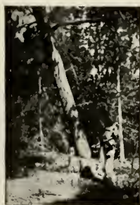
FELLING THE MONARCH